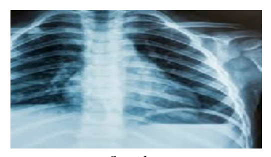
Secret Image Figure 4