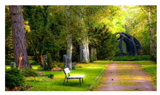
Stego Image Fig.3

GLIMPSE -Journal of Computer Science •Vol. 2(1), JANUARY-JUNE 2023, pp. 16-18