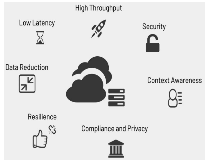
Figure 2. Benefits of Edge computing (Courtesy: Intel & Moniem-Tech).

to mobile users. MEC is also known as Edge Computing or Fog Computing. MEC can be deployed at various points in the network, including base stations, small cells, and access points. MEC enables low-latency services, such as virtual reality, augmented reality, and autonomous vehicles, by reducing the time taken to transmit data between the mobile device and the cloud.