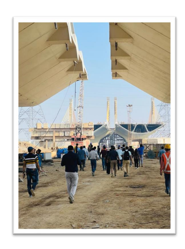
Two Individual Cantilever Bridge