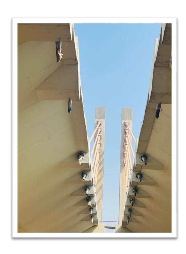
Set of Cables Connected with Bridge Segments