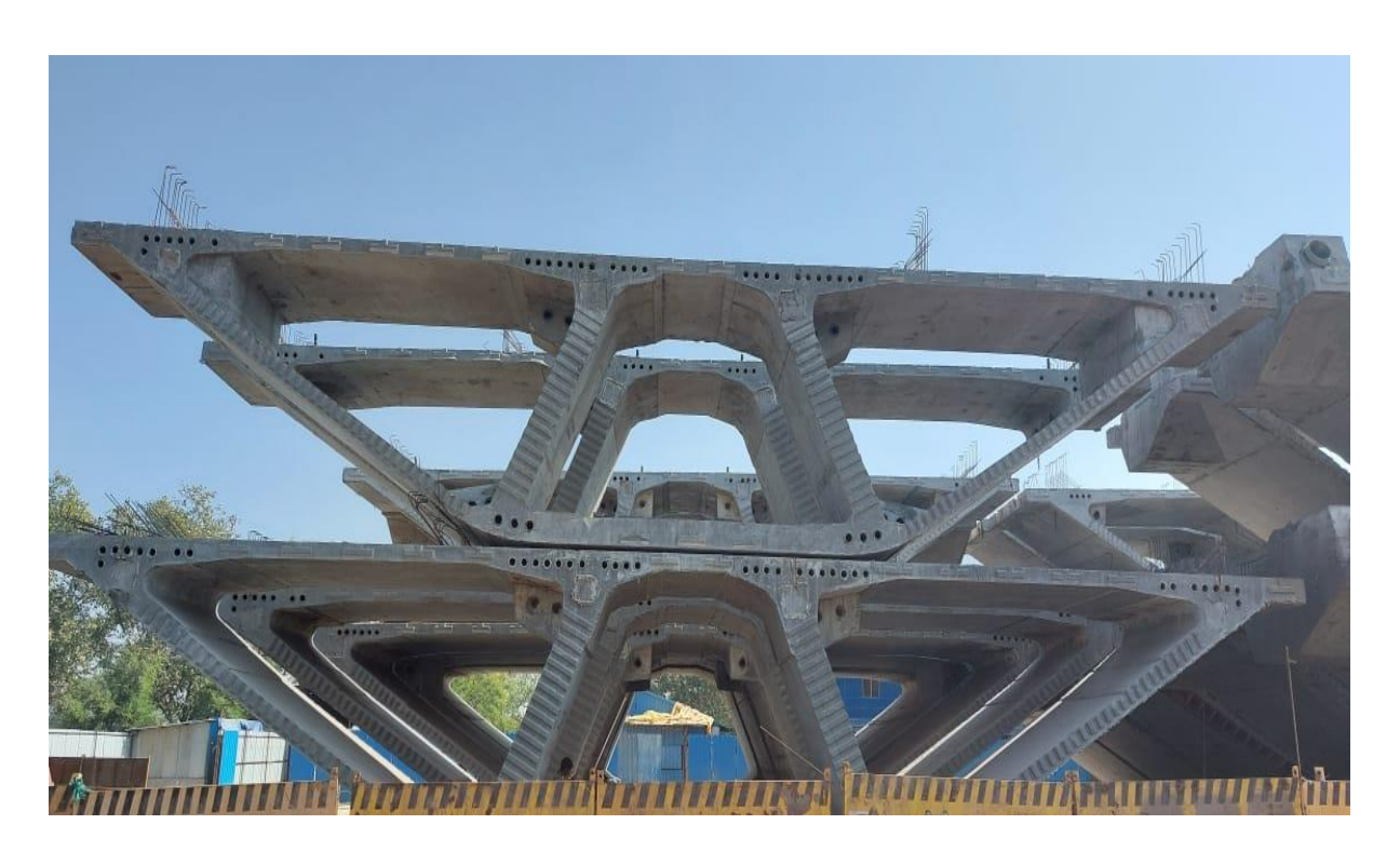
Stacking of Segments