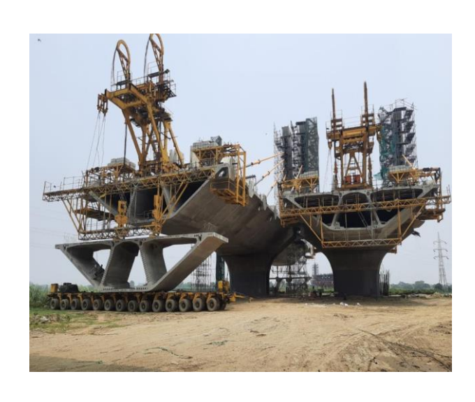
Installing Segments on piles