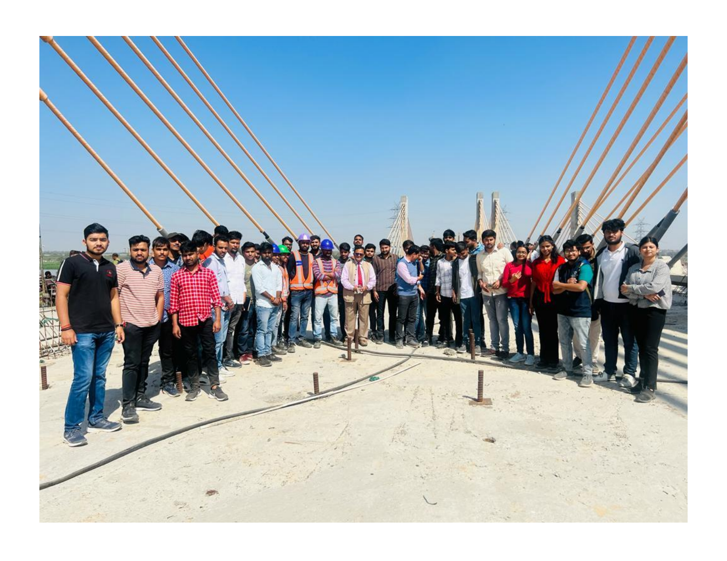
Group Picture with Site Engineers and CRRI Scientist