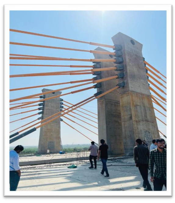
Tower of Bridge for Holding Cables