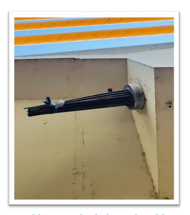
Cables Attached Through Cables