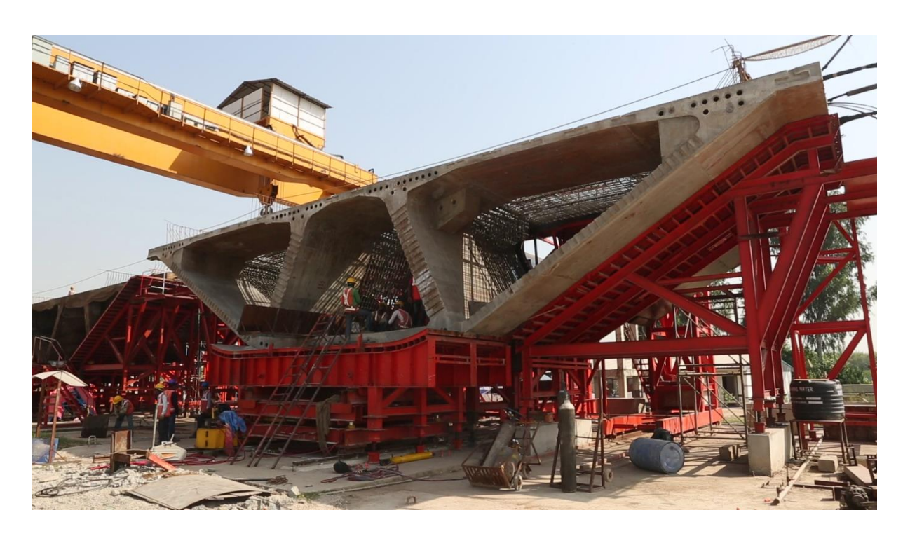
Casting of Segments