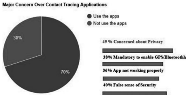
Figure 1. Major concerns over Contact Tracing Applications

With all the information about contact tracing, we conclude all the information that explains contact tracing, its functioning, and all the aspects of contact tracing have been developed. Further we cover the other aspects for the cloud platform that we aspire to design.