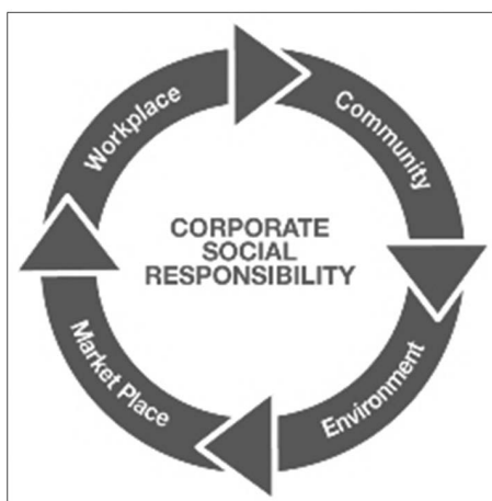
Figure 1. CSR: People, planet, profit go hand-in-hand.

Corporate social responsibility (CSR) is a modern concept concerning a company's responsibility for people, the community, and the environment.